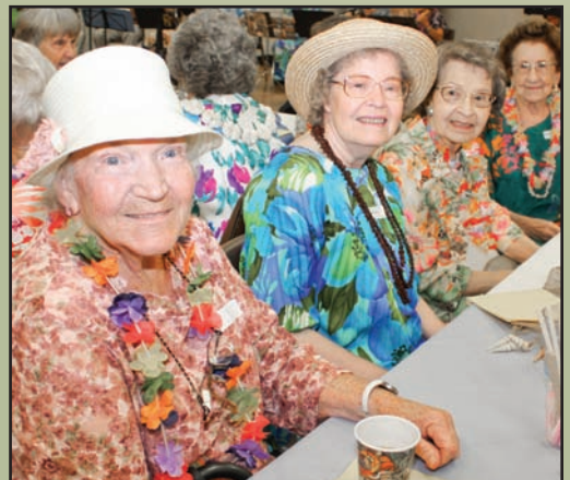
Seniors enjoying a luau lunch at a CAC Healthy Table Center.