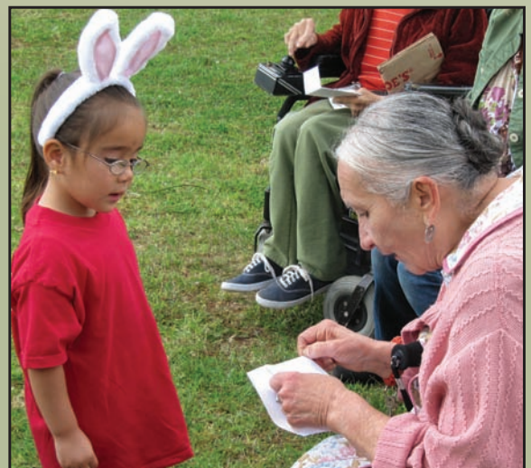
Child from CAC Carpinteria Head Start with a senior at Pilgrim Terrace