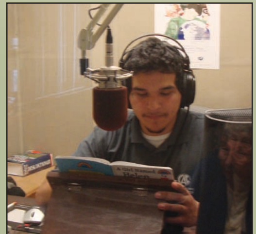
Youth Corps participant volunteering at Learning Ally