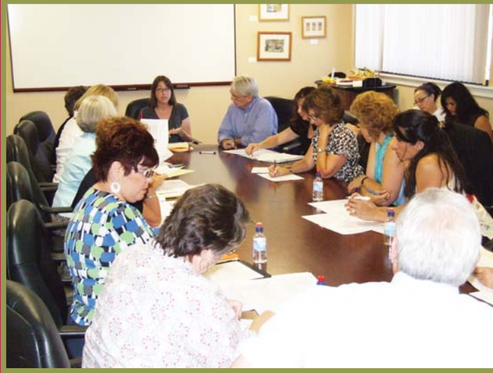
CAC's Community Reinvestment Project Sub-Contractor meeting

The recession has taken its toll in our county and this has resulted in more people needing the assistance of non-profits that serve the low-income population. Unfortunately, these increased demands are coupled with recent decreases and eliminations in state and private funding. Community Action Commission (CAC) is receiving federal stimulus funding to advance self-sufficiency and will benefit the low-income population in the following ways: