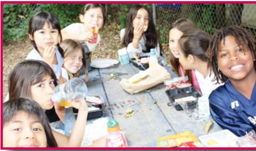
Summer Food Service Program Interns